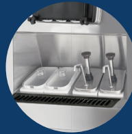
Topping Rail (Optional)

2 Flavor, Floor, Pasteurization A: Pump Feed Model